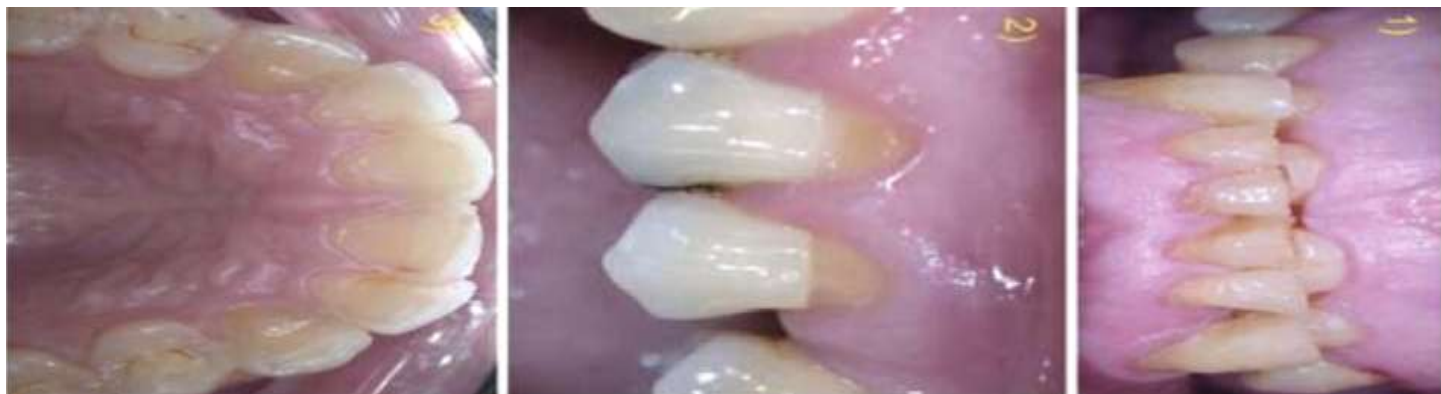
Figure 2: Dentinal exposure (location of the lesion) secondary to periodontal tissue loss due to: 1) bruxism; 2) abrasion through traumatic brushing; and 3) erosion in a bulimic patient.

In clinical practice, the dental professional must establish a differential diagnosis with other disorders characterized by pain similar to that found in patients with DS. Such disorders moreover generally require a management approach different from that used in DS. Thus, other causes of brief and acute dentinal pain include pain secondary to caries, fractured restorations, and marginal leakage around restorations, certain materials used in dental treatment, and dental fractures and fissures. 6