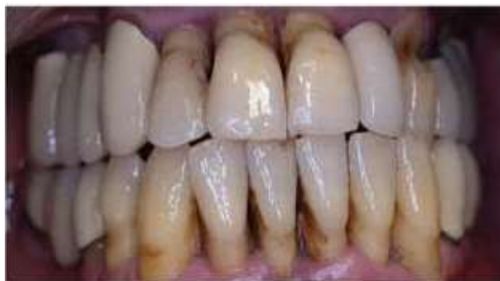
Figure 4: Dentinal exposure (location of the lesion) secondary to periodontal tissue loss

dentine. This in turn activates the As intradental nerves (of medium conduction velocity) at the pulp-dentinal interface, or within the dentinal tubules - thereby generating pain. Two phases must coincide in order to produce DS. In effect, dentinal exposure (location of the lesion) must occur (Figures 2 and 4), and the dentinal tubular system must open or become permeable towards the pulp compartment (start of the lesion)(Figure 4). 13 Dentinal exposure may be secondary to loss of enamel or periodontal tissue (gingival recession). Enamel loss or dental wear is due to attrition, abrasion and erosion, and although dental erosion is the most important single factor to be taken into account, increased dentine wear and tubular aperture occurs when it acts in synergy with abrasion. In certain teeth, abfraction, in the same way as gingival recession, may act as predisposing factor. Bone and dental anatomical anomalies, and iatrogenic lesions in dental and periodontal treatments, also must be taken into account as possible etiological factors. As regards the start or initiation of the lesion, it is believed that loss of the thin (or smear) layer coating the dentine leads to tubule aperture. 14