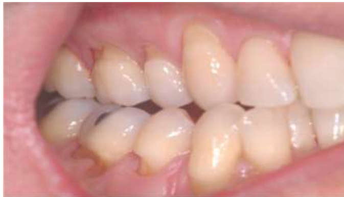
Figure 3: Abfraction in teeth