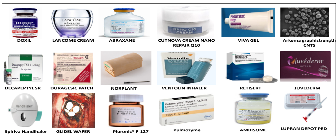
Figure 2: Marketed Novel Drug Delivery Systems